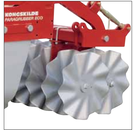
Kongskilde Paragrubber ECO 3000 with Cutter roller.