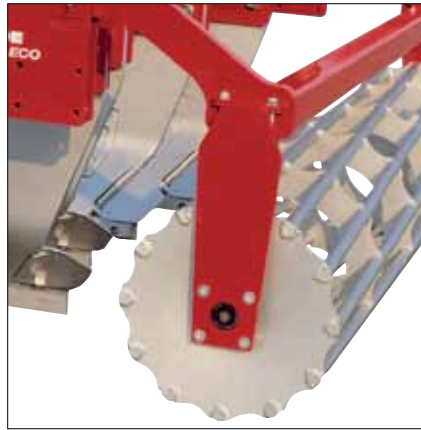
Kongskilde Paragrubber ECO 3000 with Cage roller.